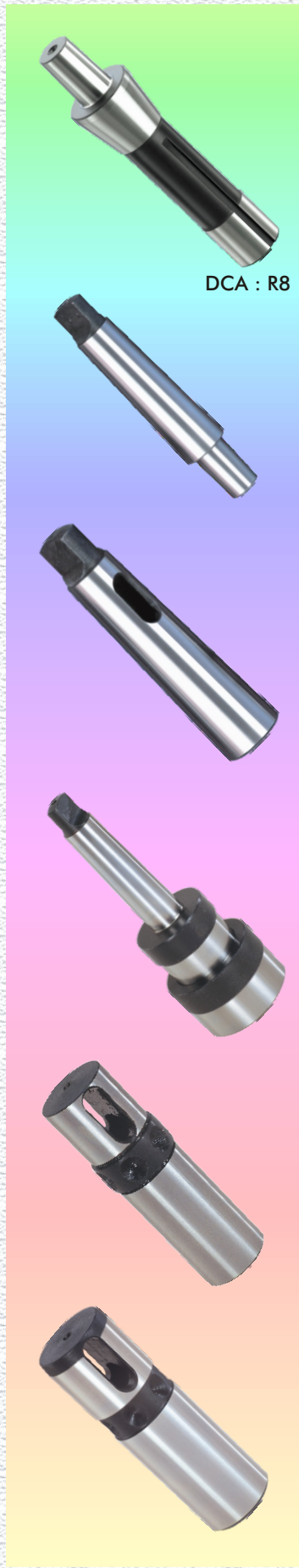
DCA : R8