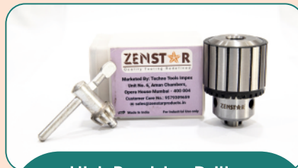
High Precision Drill Chucks, Drill Sleeves & Arbors