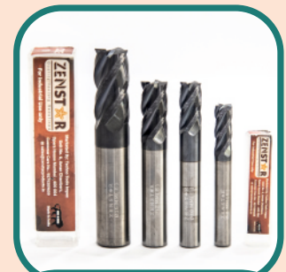
Micro Grain Solid Carbide Drills & Endmills