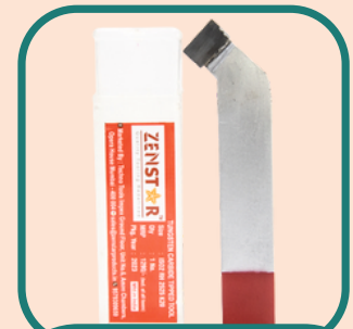
Tungsten Carbide Tipped Brazed Tools