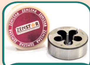
HSS External Threading Round Dies & HEX Nuts